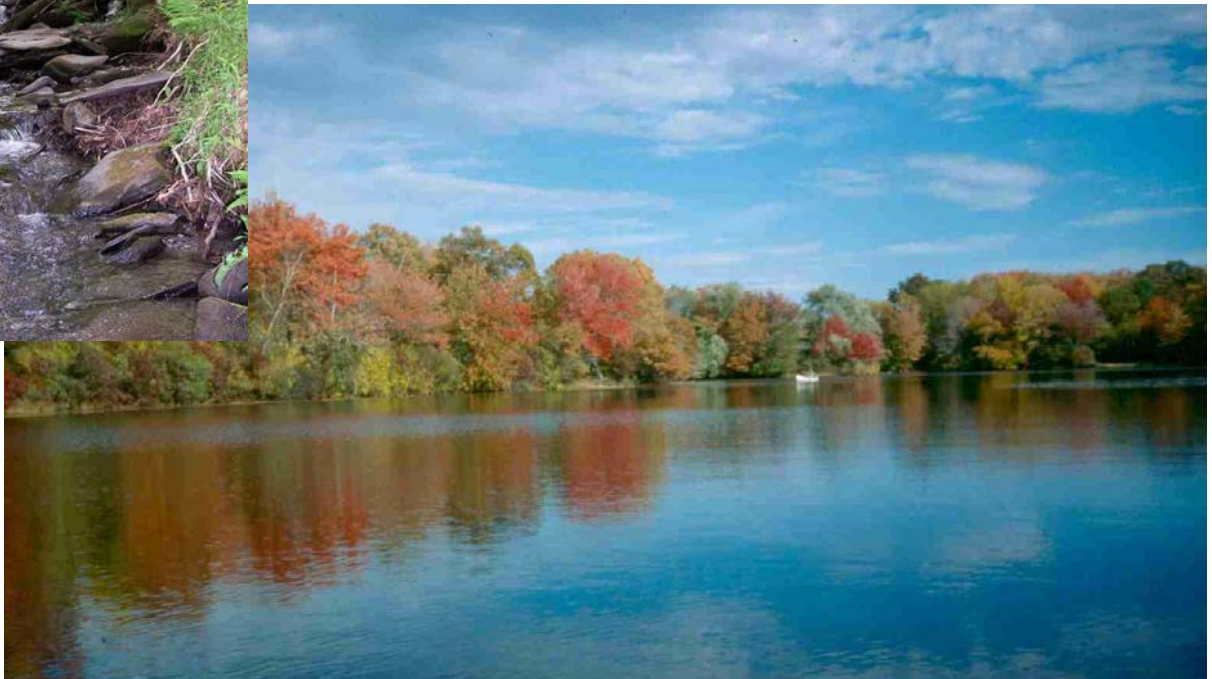
Secret Lake, North Kingstown RI